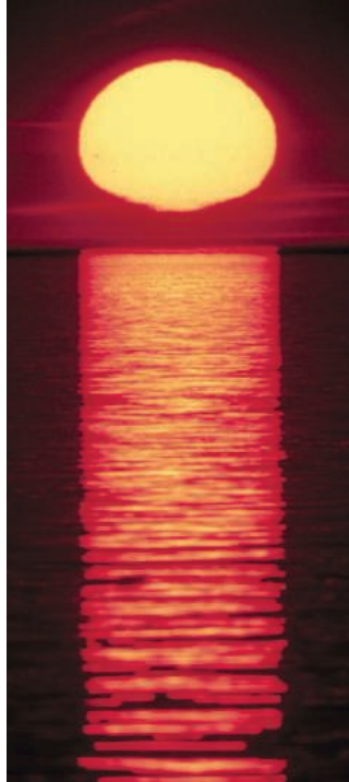
Tunneling site. Proton tunnelling allows hydrogen fusion in the Sun to occur "even at the ultralow temperature of 15 million degrees."

And yet, there is a sense in which the book is a disappointment. There are other books out there, after all, that deal with the topics of quantum mechanics and relativity. To stand out from the crowd, any new entry should have something distinct to offer. It might be the unique insight of a true master of the field, as we find when Richard Feynman writes about quantum electrodynamics or George Gamow writes about the